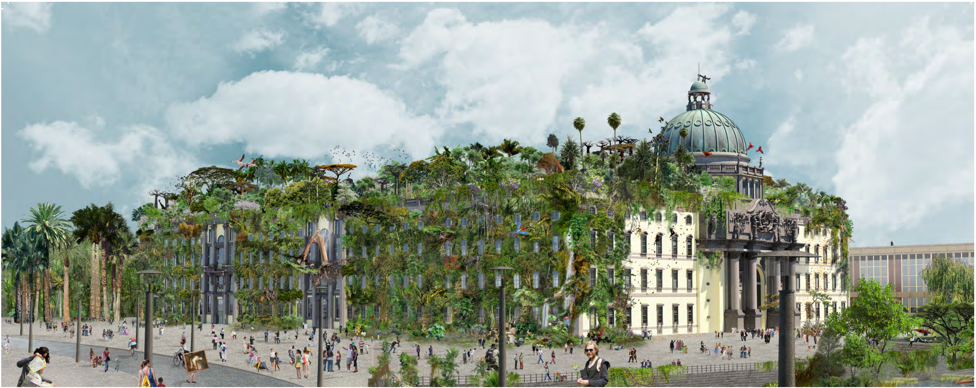
Fig. 1 Humboldt Jungle by Hybrid Space Lab, 2015, Hybrid Space Lab