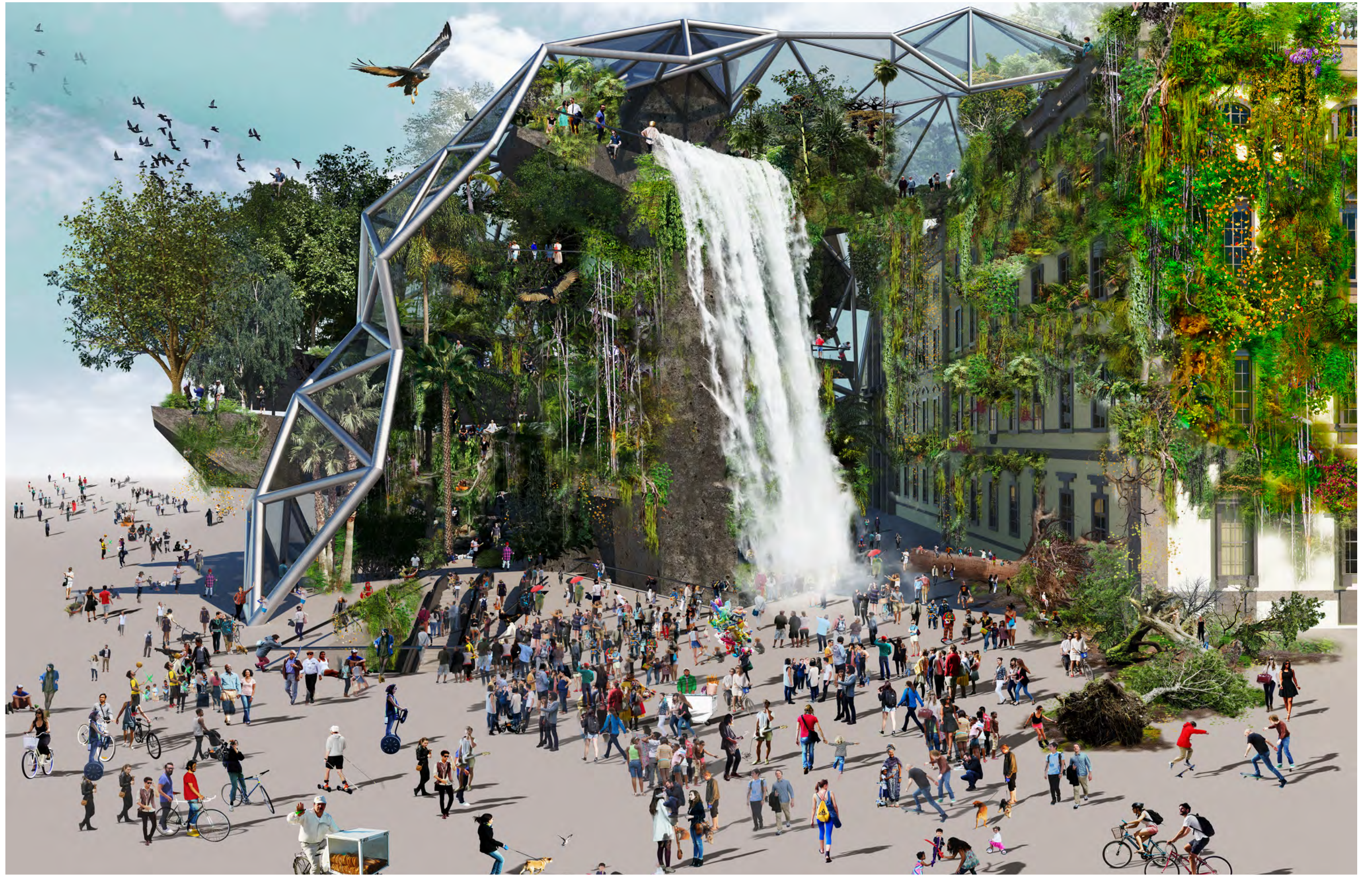
Humboldt Volcano, 2016 Hybrid Space Lab