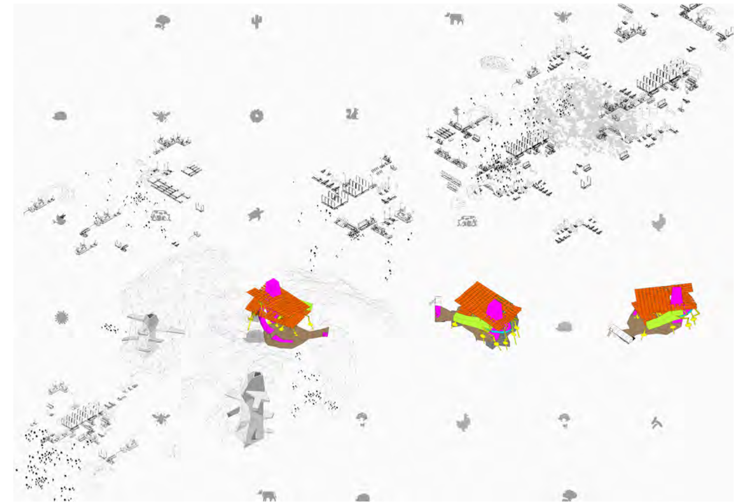
Humboldt Futures, 2023 Hybrid Space Lab

Note: The first Humboldt Futures workshop, co-organized by gamelab.berlin and Hybrid Space Lab, took place on 12.01.2024.