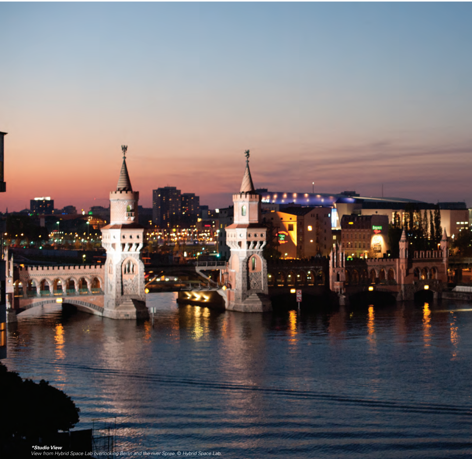
*Studio View View from Hybrid Space Lab overlooking Berlin and the river Spree. © Hybrid Space Lab.